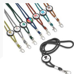
Lanyard Dome – HBD-015