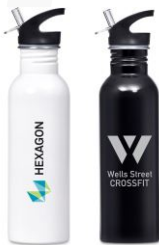
Straw Bottles – HCB- 7155