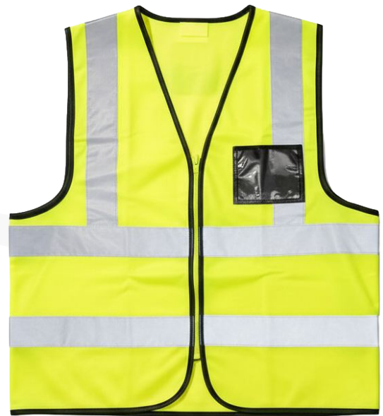
EN2 Lime Reflective Vest