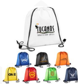
Draw Sting Bags – HCB-0052