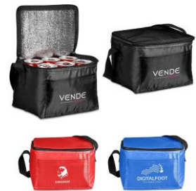
Lunch Bags – HCB-INH01