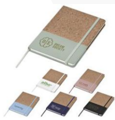
Note Books – HCB-155-B