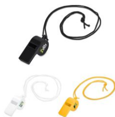
Whistles – HCB -181-B