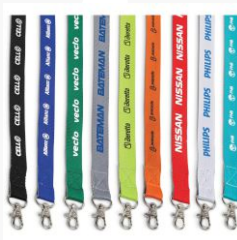
Lanyard flat – HCB-030