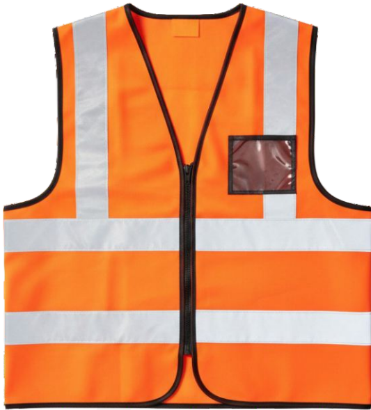
EN2 Orange Reflective Vest