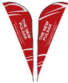
Shark Fin Banner