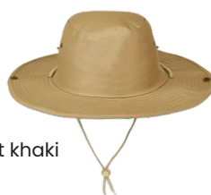
Bush hat khaki