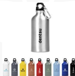
Bottles – HCB-6593