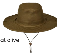
Bush hat olive