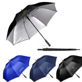
Umbrellas – HCB-8P