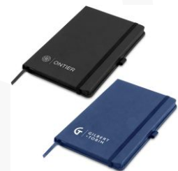
Plain Note Books – HCB-NOTE3