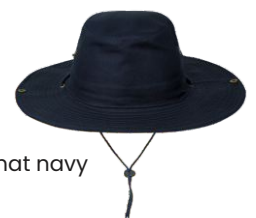
Bush hat navy